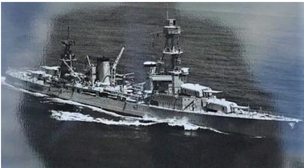
The Heavy Cruiser - “USS Pensacola.

The Opening Chapter being the arrival of the Pensacola Convoy which berthed on 22 nd of December 1941. The story began with the first presence of US Forces in Australia, when a convoy of 7 cargo and troop ships (known as the “Pensacola Convoy”) was being escorted by the “USS Pensacola”, en-route to re-equip the US Base in Manila. However, following the bombing of Pearl Harbour by Japanese forces, the convoy was diverted to Brisbane. The convoy was the first of the military forces (US battalions of men and their military equipment) to arrive from the US on Australian soil. The convoy discharged its men and equipment at a location at Hamilton Wharf - now known as “Pensacola Place” at Brett’s Wharf, located downstream from Newstead Park.