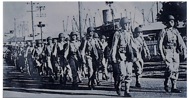
US National Guard soldiers marching along Racecourse Road Hamilton in Brisbane, after being discharged from their troop ships.