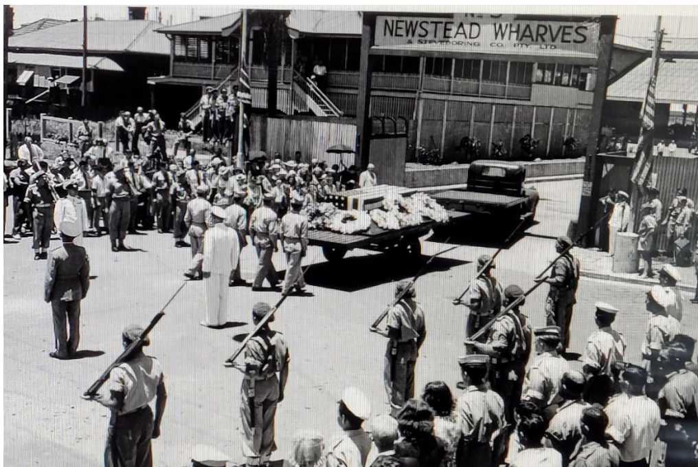
The coffin being transported finally through the gates of Newstead Wharves.

A mere six years to the day, since the Pensacola Convoy arrived on 22 nd December 1941 to render on-the-ground assistance to Australia, against the Japanese assault expected, following the bombing of Pearl Harbour (as you may know - Pearl Harbor was the US Naval base, west of Honolulu., that was bombed by the Imperial Japanese Navy on 7 th December 1941, in a surprise attack).