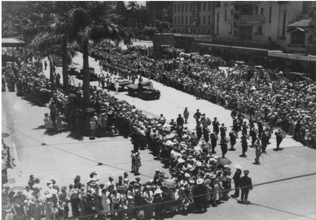
The coffin of the unknown US Serviceman being transported in a solemn procession through the Brisbane CBD to Newstead. The Procession was watched by over 30,000 Brisbane residents.

This Memorial Sign is located at the river-end of the Maud Street entrance, to the Park. The entrance was used by the Parade of the Unknown Soldier, which was the last coffin of a US Serviceman loaded onto the USAT Goucher Victory, on 22 nd of December 1947.