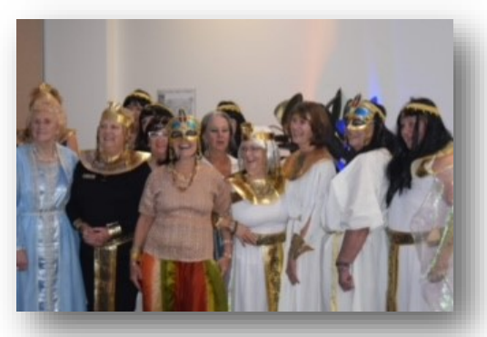
Group shot of costumes