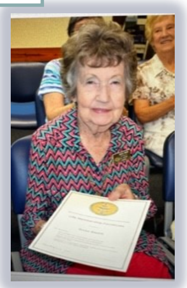
Receiving Life Membership 5 Dec 2013