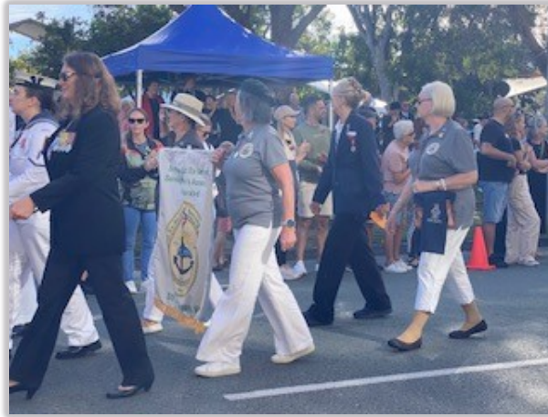
Maroochydore Ex Service Women