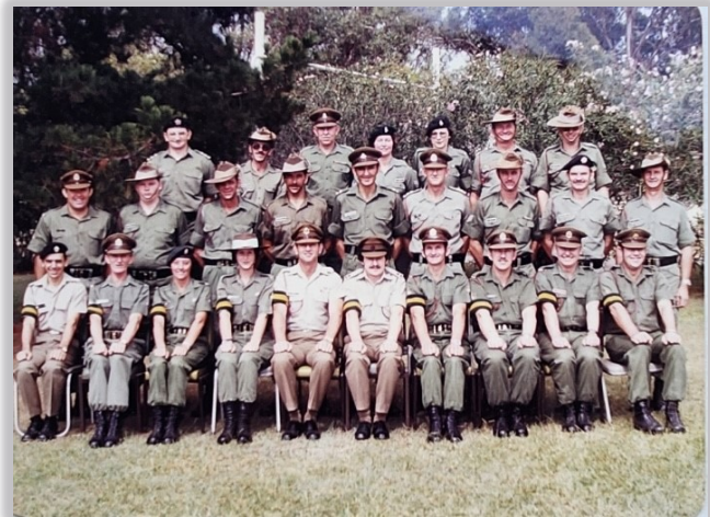
Working with the old and bold Vietnam veterans