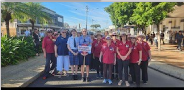
Left & Right Bundaberg District Women