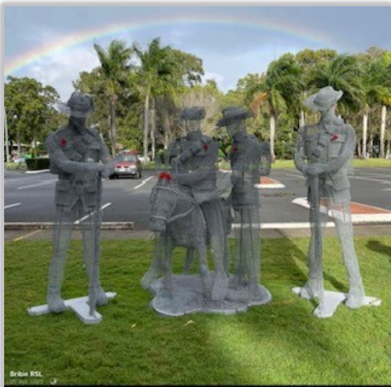
Bribie Island RSL Display