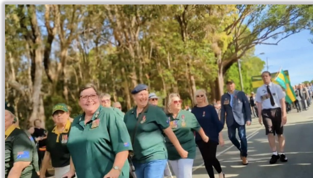
Proud Bribie—Ex Service Women