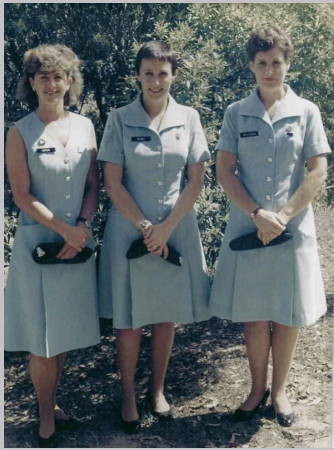
1985 the three Mouseketeers