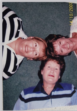
Same, three years later