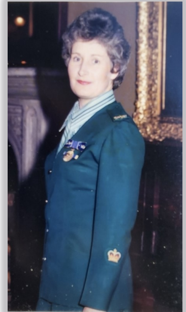
Receiving OAM at Government House

As you can all relate, we have made many unique and special friendships over our “green” time. I worked with and at the same time learnt so much from many “old and bold” soldiers from the Vietnam era and the Australian Army Training Team Vietnam AATTV.