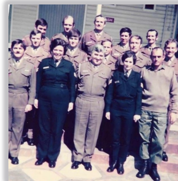
Instructor Development Course