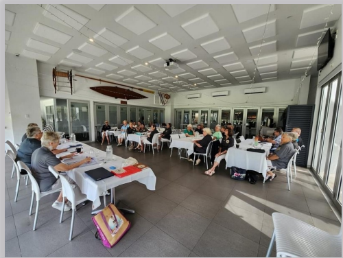
OGM/AGM held on 4 April 2024 at Kawana Surf Club