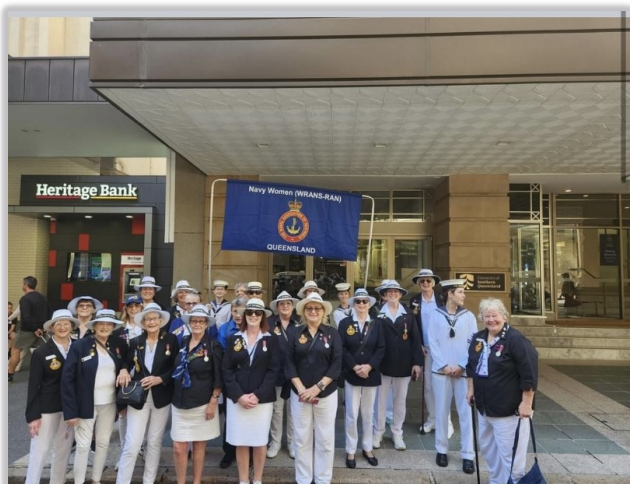
NAVY Women—Brisbane March