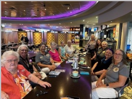
Coffee and Catch Up held at Maroochy RSL on 7th March