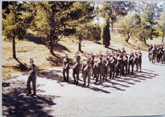
Platoon Commander Recruit March Out Parade

The change from WRAAC to Royal Australian Corps of Transport (RACT), meant I had to qualify for an extra subject, Subject 4. I held the position of Warrant Officer 2 Coordinator (WO CO-ORD) for the Training (TRG) Wing.