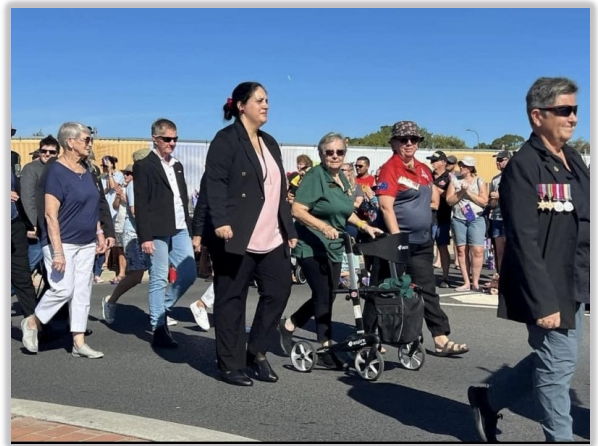
Hervey Bay Ex Service Women