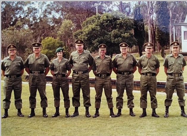
Australian Army Training Team Vietnam