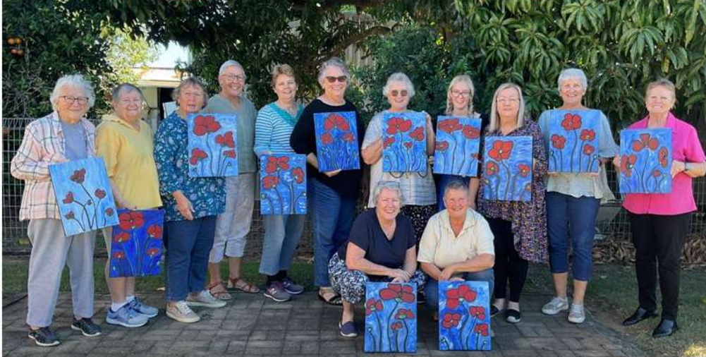
Check Facebook for more painting pics