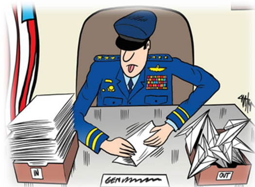
This guy obviously helped the WRAAF Singers make their planes