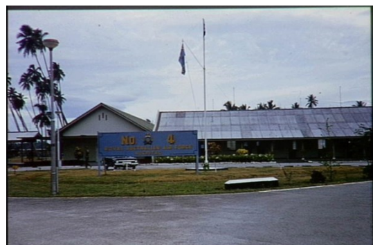
No 4.RAAF Hospital Butterworth