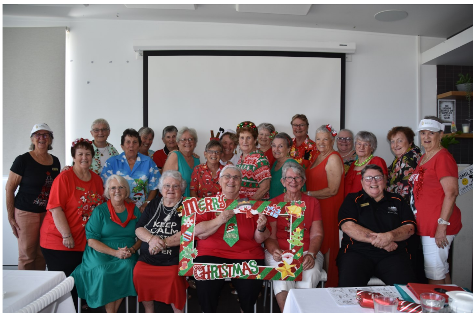
WRAAC & RAANC