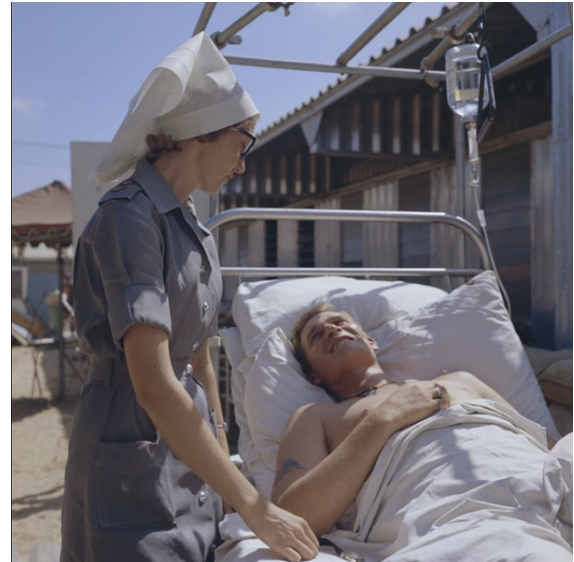
South Vietnam, November 1968. A nursing sister attends to a soldier outside