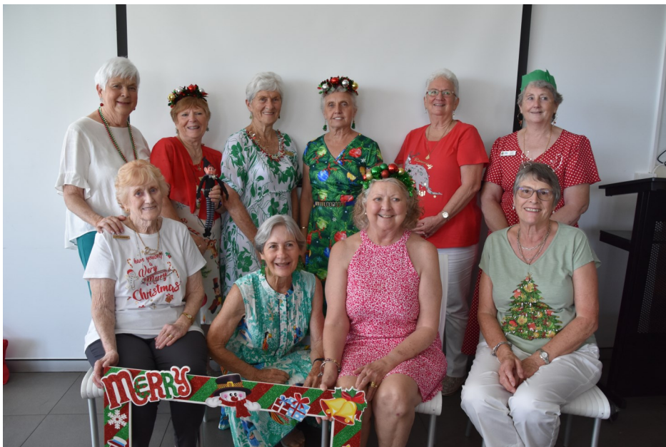
WRAAF & RAAFNS