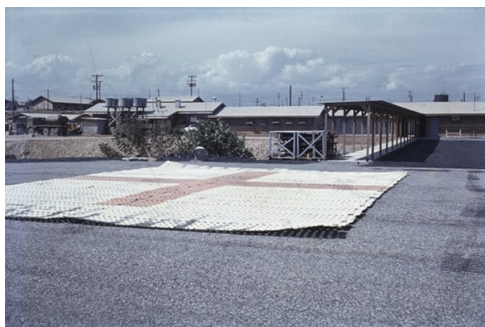
The Helicopter landing area known as Vampire at the 1st Australian Field Hospital, Vung Tau