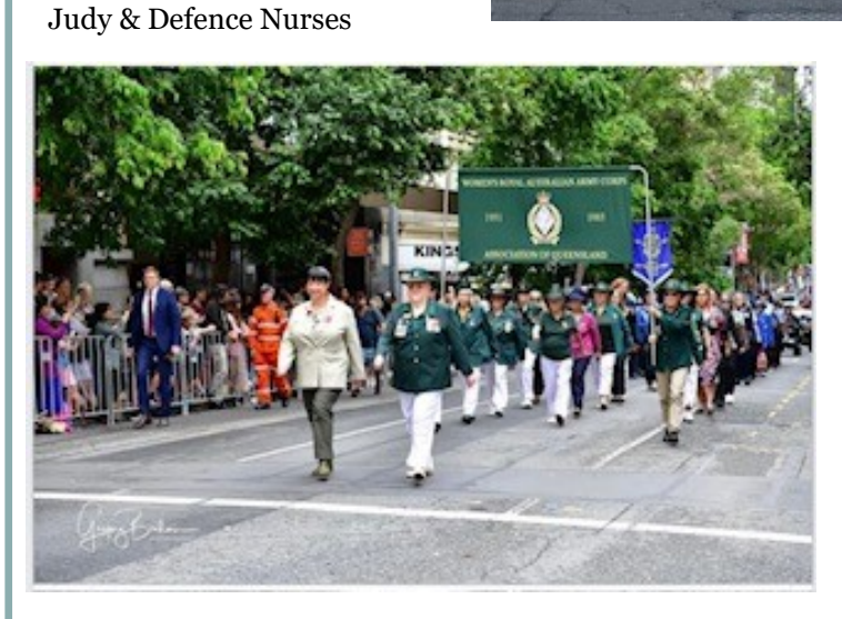
WRAAC ASSN QLD with 31 Platoon Delta Company