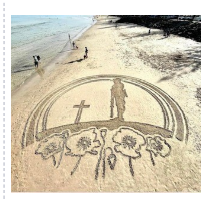
ANZAC Day Sand Art