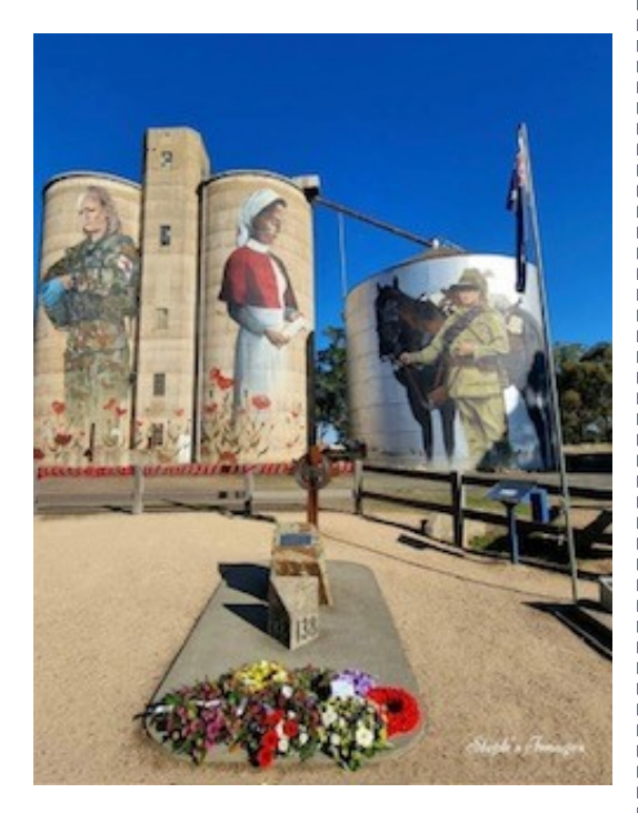
WW1 Silo Art - Devenish VIC