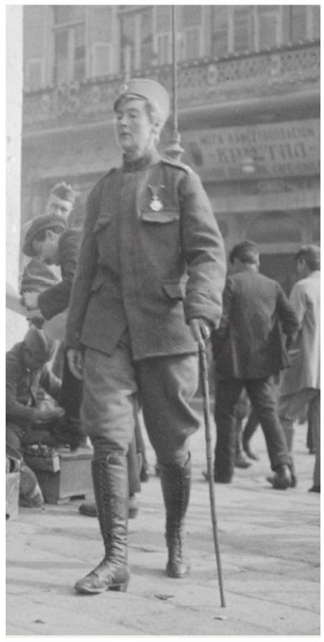
Walking with a stick due to her injuries from a grenade in hand to hand combat