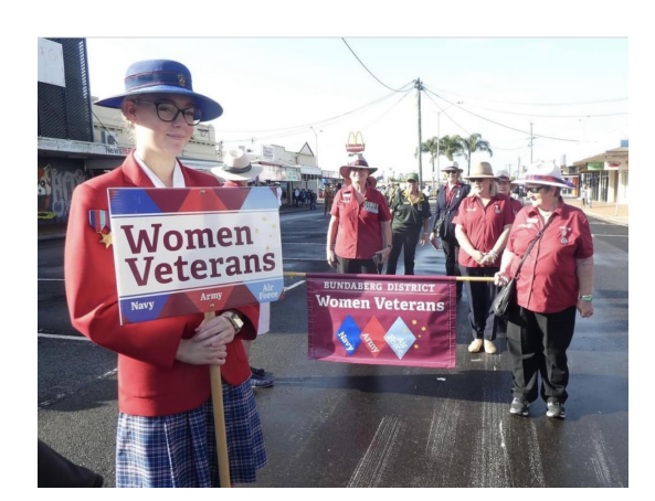
Bundaberg Women Veterans