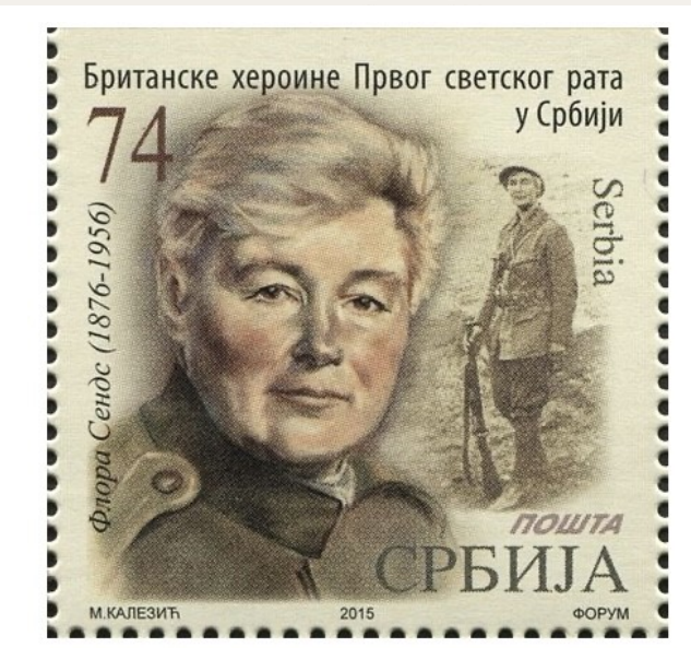
Serbian stamp in her honour 2015