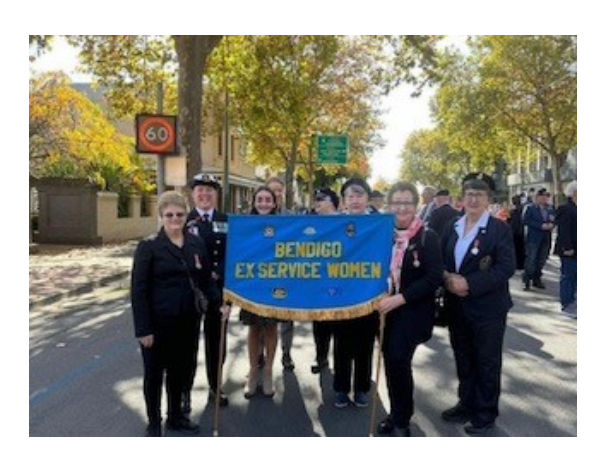
Bendigo Vic-Ex Service Women