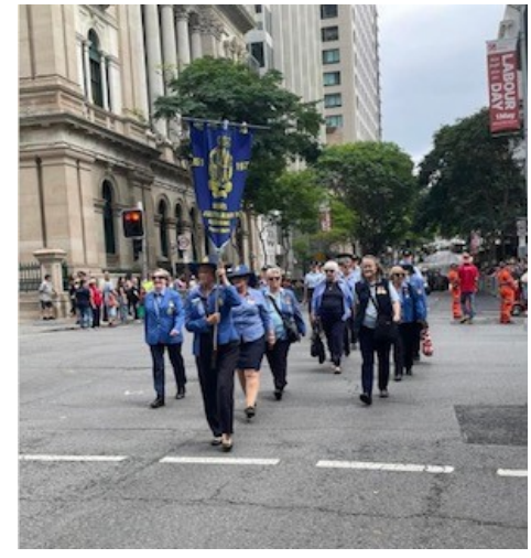
WRAAF ASSN QLD