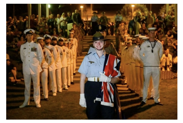
Caloundra Dawn Service