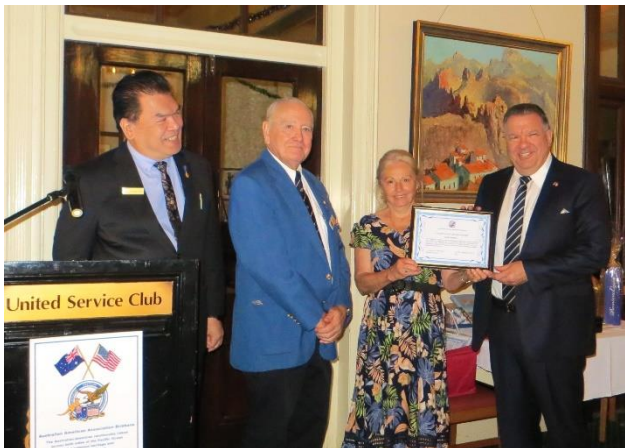
The Honourable Santo Santoro (far right) Former Australian Senator, receiving his Life Member Certificate.