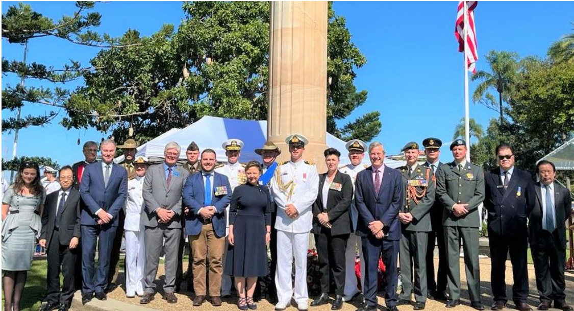
Last year's Battle of the Coral Sea Wreath-laying Service, held at the Australian American War Memorial, Lyndon Baynes Johnson Place Newstead, Park. Some 190 guests attended this service.