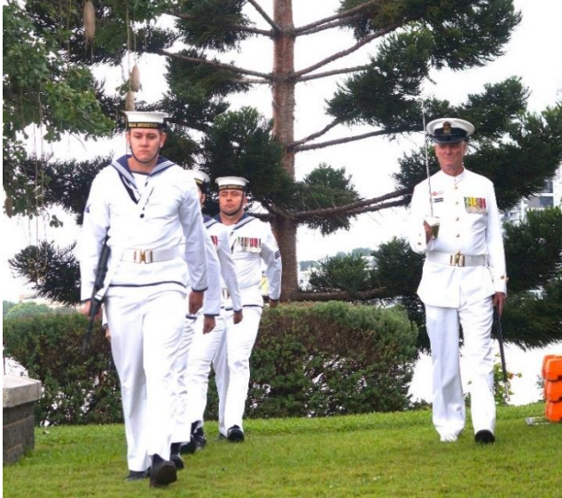
Mounting of the Australian American War Memorial Monument, by the Royal Australian Navy Cenotaph Party from HMAS Moreton, Brisbane.