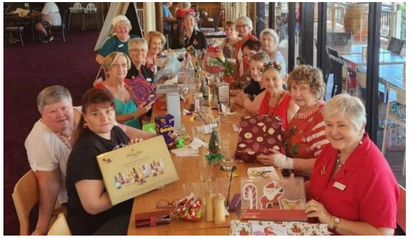
2 January 2024 - improputu