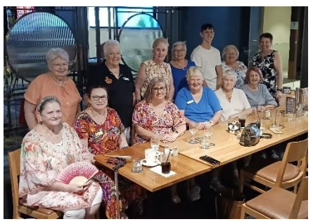
8 January – Caboolture Sports Club