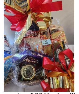
Hamper from BCC Marchant Ward