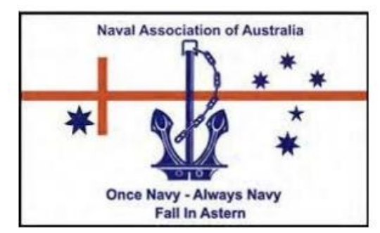
I copied this from the SA Newsletter - very effective